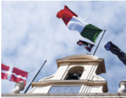
The Order's flag flies over the Quirinal Palace, seat of the President of the Italian Republic