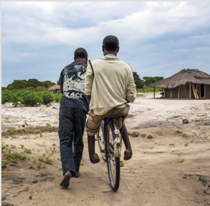
▲ In Mozambique, the Order works with leprosy victims, providing specialist care and training

Segou, Sikasso and Mopti and Bamako district, as well as a specialised centre for children with mental disabilities.