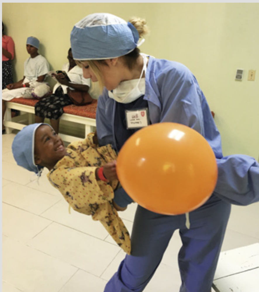
▲ The Dominican Association manages mother and childcare in poor areas of Santo Domingo