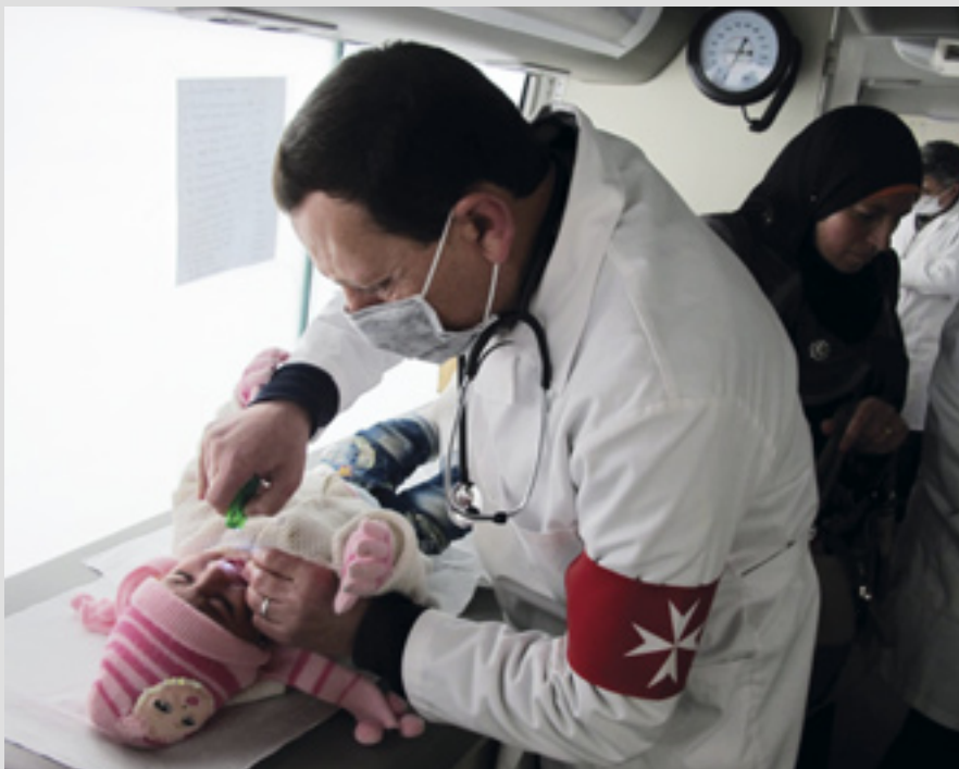
▲ A small Syrian refugee is attended to in the Order's mobile medical clinic in north Lebanon

With the liberation of Mosul in 2017, its citizens began to return gradually, but the situation is precarious, both medically and socially. Malteser International has distributed relief goods and is gradually rebuilding healthcare capacities and offering psychosocial support to the traumatised. They will intensify their work in training and income generation and have launched 'Cash for Work' programmes, with many women participating in courses promoting good hygiene, becoming teachers and helping their communities to respect practices that can prevent epidemics.