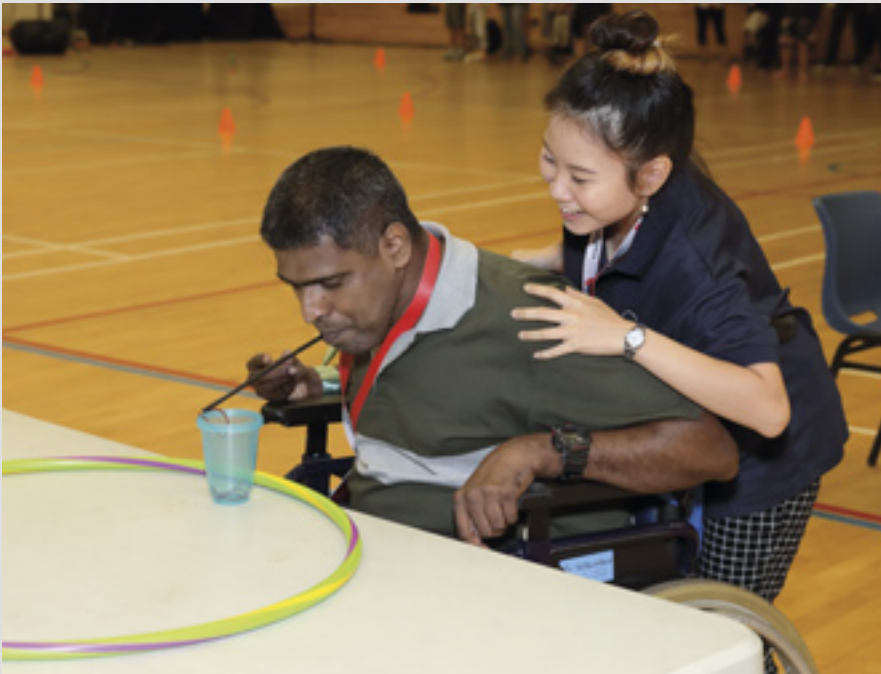
▲ The Asia Pacific summer camp for young disabled is now an annual event