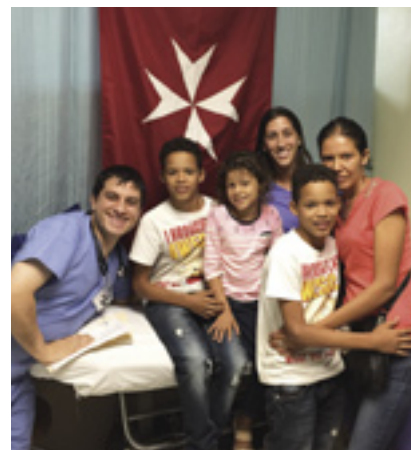
Volunteer medical missions in the Dominican Republic treat locals free of charge, attending to thousands of patients each year

In 2017 the San Juan Bosco Clinic celebrated 25 years of service to the community of documented and non-documented poor in Miami. Members of the Cuban Association continue to volunteer their time and over 800 patients are seen every year and, where necessary, are referred to specialists who provide over 2,800 annual visits free of charge.