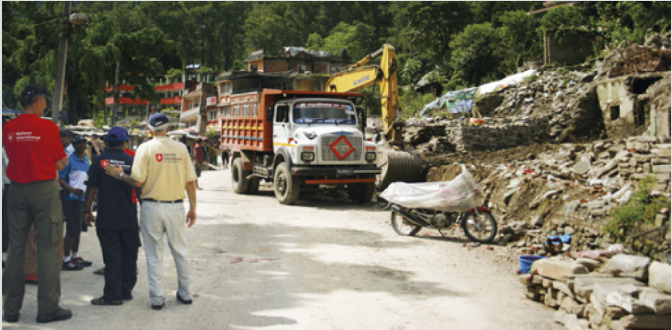
▲ The Order's international relief agency, immediately on site after the Nepal earthquake with emergency aid, is now rebuilding homes and livelihoods

mary health care, WASH, Disaster Risk Reduction programmes, climate change adaptation and post disaster relief. Another focus is health care for displaced people (the Rohingya) who have fled from Myanmar to Thailand and Bangladesh, where they do not have refugee status and are therefore not eligible for medical care.