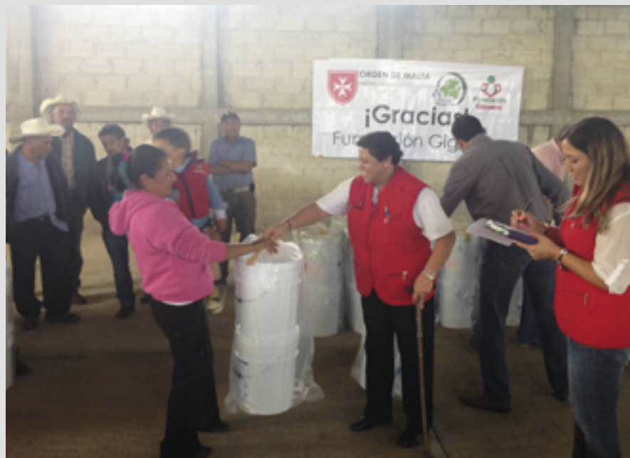
▲ Distributing water filtration equipment after natural disasters

In January 2017, parts of Peru were battered by almost unceasing rains with consequent floods, landslides, loss of life and more than 100,000 people losing their homes. Over half a million were affected by the storms and the resulting damage, over a number of months. In response, staff from Malteser Peru, and Order volunteers, provided food, water, and clothing to victims in Ate in April 2017, and to victims in Piura in May.