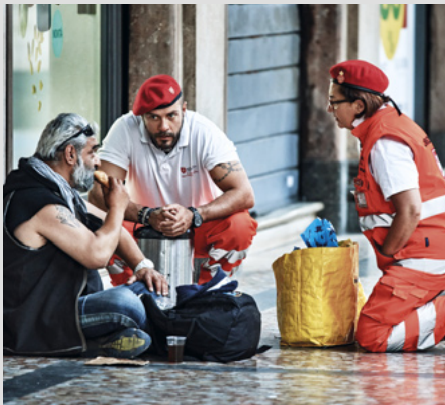
▲ The Italian Relief Corps runs many activities, including distribution of food for the destitute

New activities: a refreshments trolley service for patients at the Sir Anthony Mamo Oncology Centre, launched in 2016; a prison ministry project for young foreign inmates at the Corradino Correctional Facility, with regular visits, and psychological support as they enter rehabilitation programmes. The Order organises an annual Thanksgiving Supper and a summer barbeque for all inmates at the Young Persons Offenders Unit in Mtaħleb; and a forthcoming project to provide shelter and