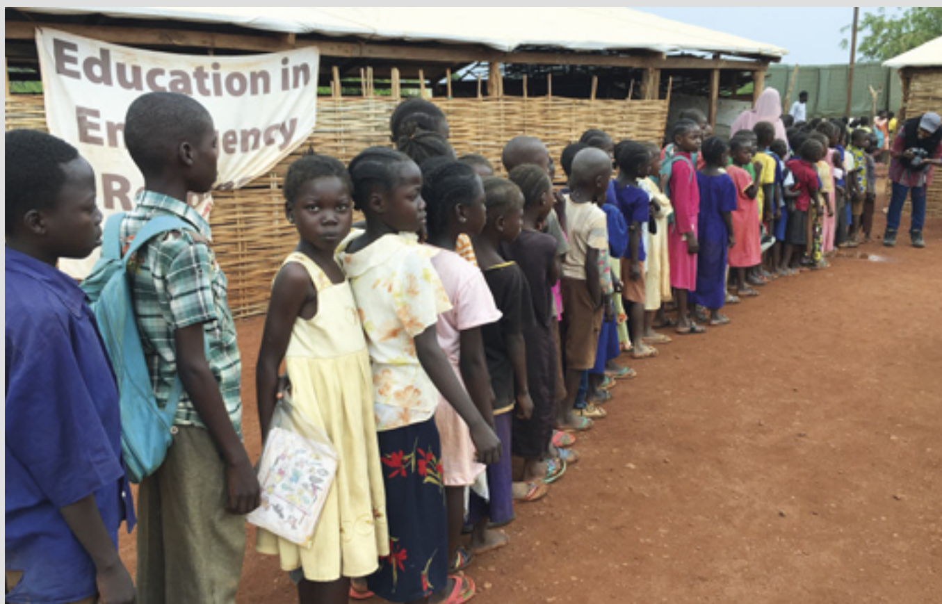
▲ School pupils line up for hot, nourishing meals in South Sudan, provided by the Order's Malteser International

Ordre de Malte France has also signed a cooperation agreement with the DAHW (Deutsche Lepra- und Tuberkulosehilfe e.V.) for detection of tuberculosis and leprosy including cases in remote villages. A second partnership has been signed with Hilfe für Senegal who donated medical equipment (wheelchairs, crutches, etc.) to the dispensary in Gorée.