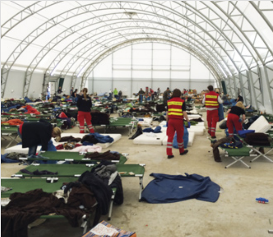
▲ Refugees are cared for on arrival in Austria. Malteser Hospitaldienst Austria has been providing a wide range of care for those in need since 1956