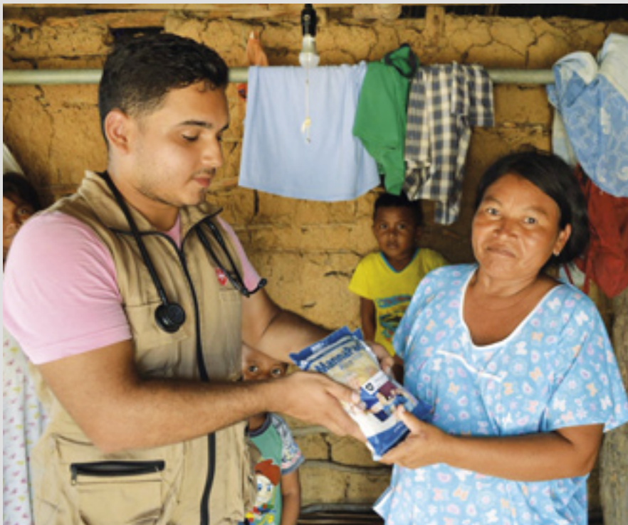
▲ Emergency kits are distributed following disastrous floods in Colombia

Following a recent natural crisis - the avalanche which hit the provincial city of Mocoa in 2017, killing hundreds and leaving thousands homeless, the Colombian Association shipped four containers of medicines and emergency supplies and 17 tons of nutrition supplements.