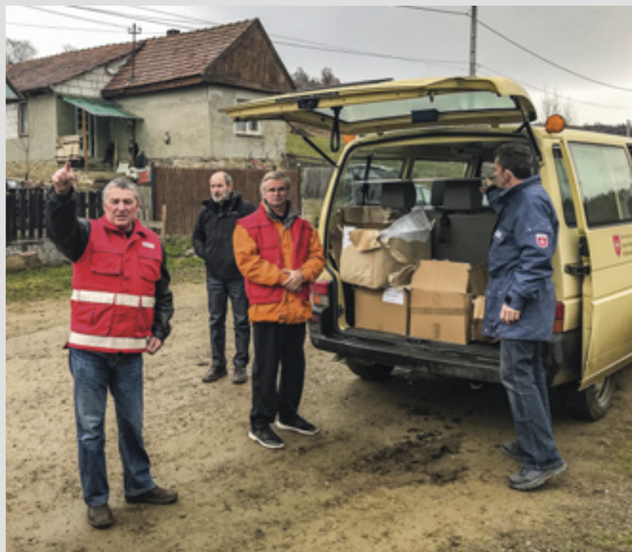
▲ In Eastern Europe, regular deliveries of supplies to impoverished local villages are a lifeline