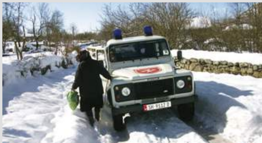
▲ Harsh winters in the north of the country mean emergency callouts for the Order's Relief Organisation in Albania (MNSH)

Malteser Hospitaldienst Austria (MH-DA), the Order's Austrian relief organisation, founded in 1956 and today a significant volunteer emergency service in the country, counts 2,000 volunteers, who, together with Order members,