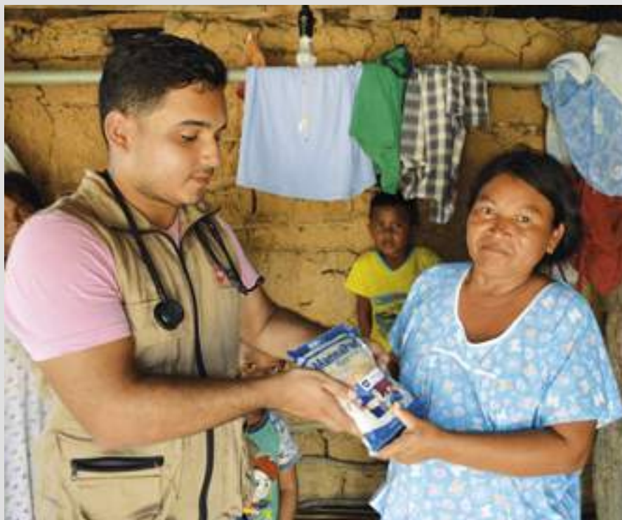
▲ Emergency kits are distributed following disastrous floods in Colombia

Following a recent natural crisis - the avalanche which hit the provincial city of Mocoa in 2017, killing hundreds and leaving thousands homeless, the Colombian Association shipped four containers of medicines and emergency supplies and 17 tons of nutrition supplements.