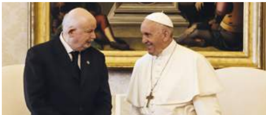
His Holiness Pope Francis greets the Grand Master for the annual audience, Vatican