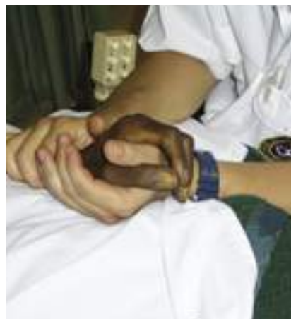
The Care Centre and hospice comfort the sick and the dying who would otherwise suffer alone and untreated