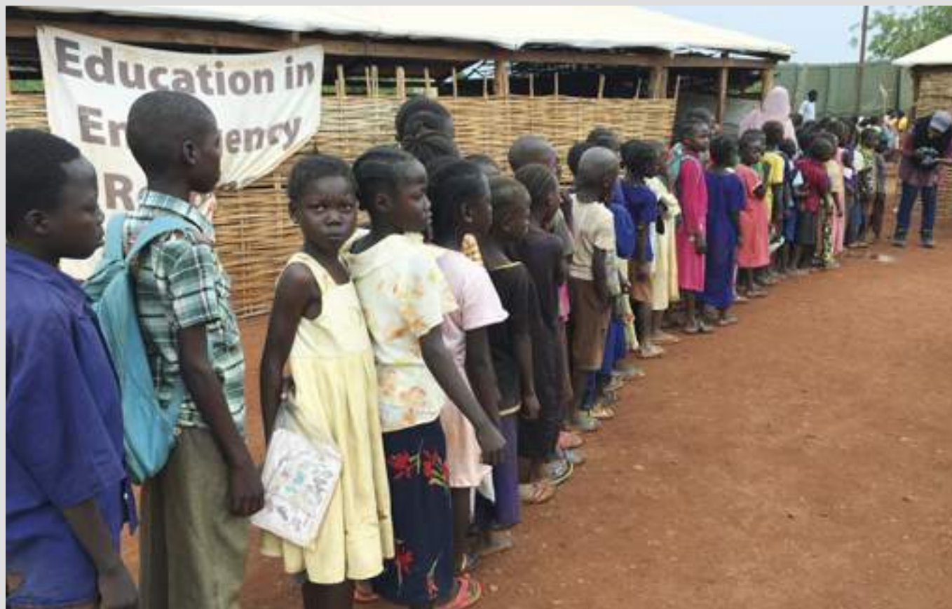
▲ School pupils line up for hot, nourishing meals in South Sudan, provided by the Order's Malteser International

Ordre de Malte France has also signed a cooperation agreement with the DAHW (Deutsche Lepra- und Tuberkulosehilfe e.V.) for detection of tuberculosis and leprosy including cases in remote villages. A second partnership has been signed with Hilfe für Senegal who donated medical equipment (wheelchairs, crutches, etc.) to the dispensary in Gorée.