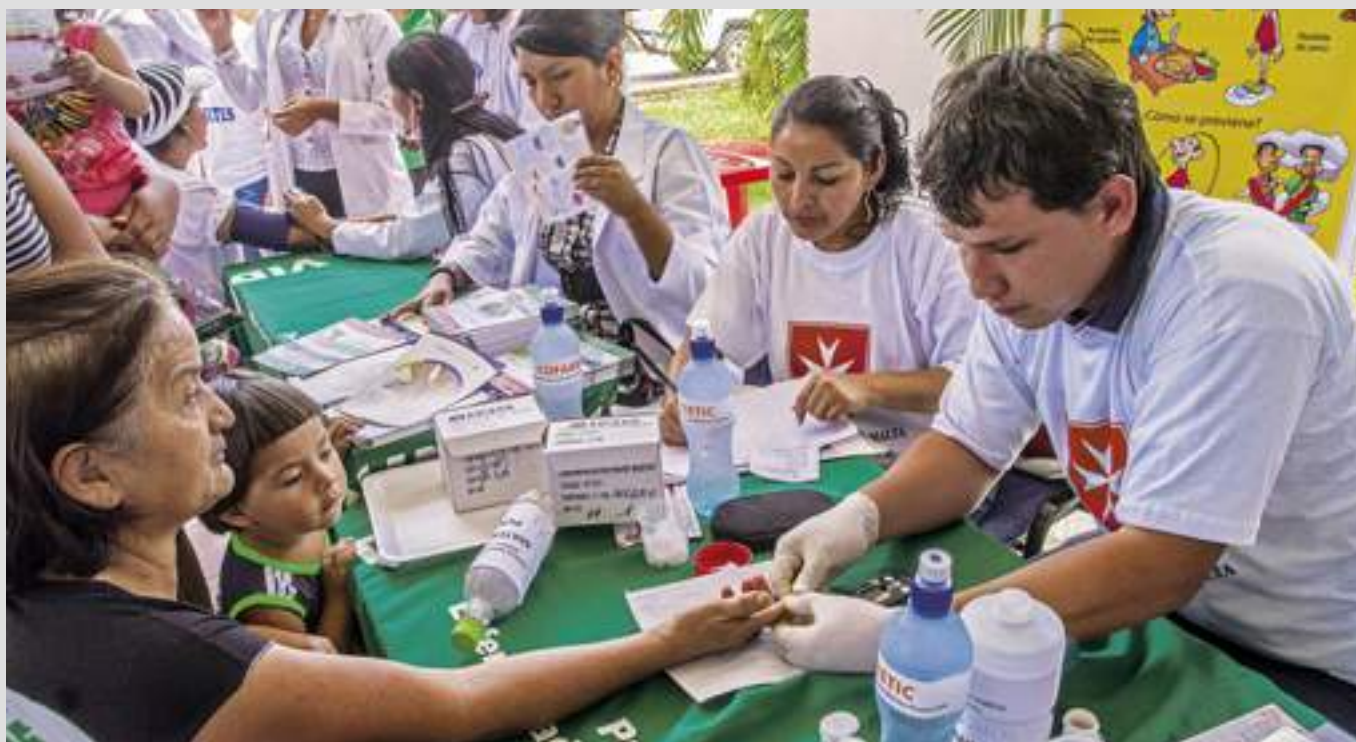
▲ World Day Against Diabetes, Bolivia: the Order, in collaboration with the University of Santa Cruz de la Sierra

Varela, south of Buenos Aires, provides free dental and eye care to more than 100 underprivileged children daily. For complex cases it has a cooperation agreement with the University of La Plata.