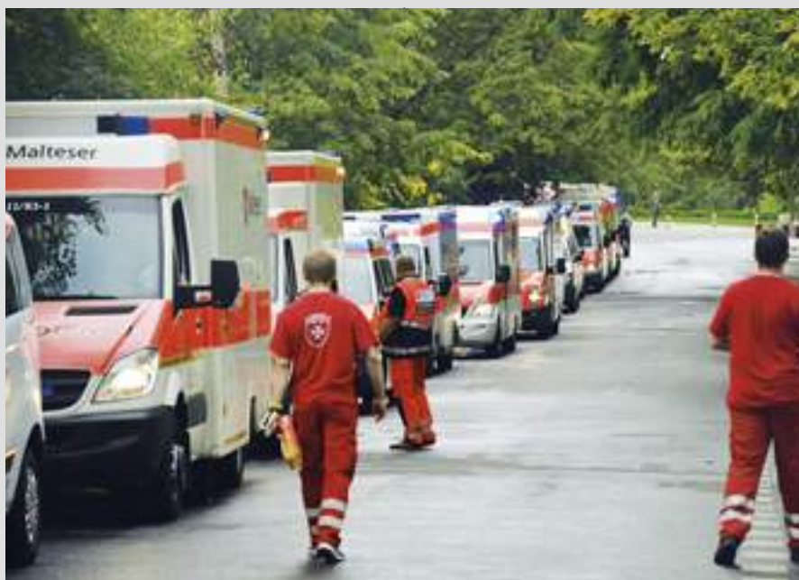
▲ Lineup of Order ambulances – medical support for World Youth Day in Krakow, 2016

mentoring for small numbers of homeless youths. A team of members and volunteers have accompanied guests to the Order's International Camps each year – 2016, 2017, 2018.