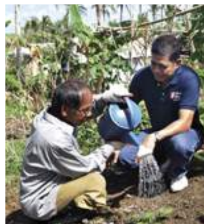
Encouraging micro-finance programmes helps local farmers to grow their own crops, for market as well as for home

Ultimately it is about humanising migrants. Our narratives and projects need to generate empathy and prevent the dehumanisation of migrants in mainstream narratives. Stories of individuals, emphasising commonalities (as opposed to celebrating diversity), can help address this issue. We need to look at connections between host communities and migrants that promote understanding and respect such as volunteering. Ultimately the message of a Shared Humanity is one that should resonate with everyone relying on empathy and reciprocity. They contribute to advocate for the basic minimum standards of human dignity that must be afforded to all migrants, irrespective of status, irrespective of whether you believe there should be more or less migration.