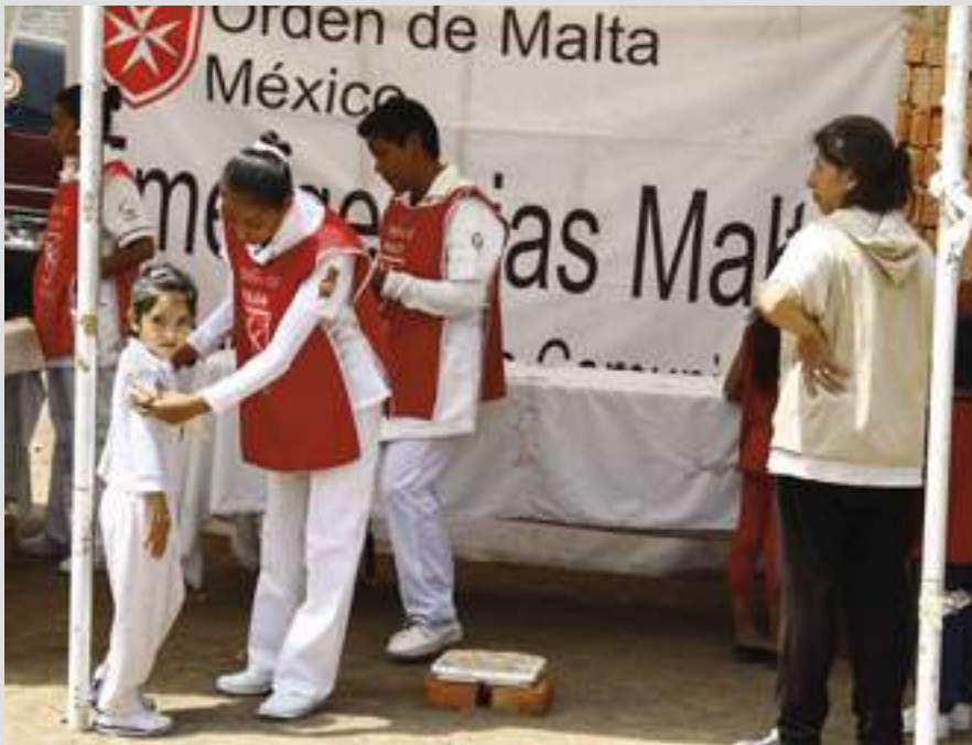
▲ Healthcare event for disadvantaged youngsters in Mexico City