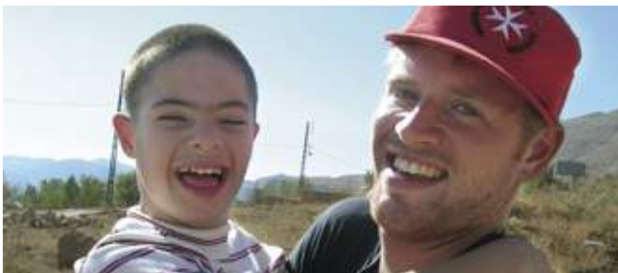
The Order runs summer camps in Lebanon for disabled youngsters as well as for young adults

The Chabrouh Centre hopes that its contribution will transform doubt into love, that peace will one day reign across the Middle East, that Lebanese Christians will feel they are not alone, and that they can trust in the future of Christianity in Lebanon and the region.