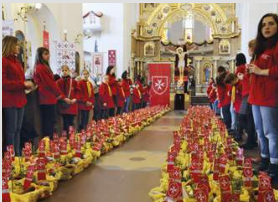
▲ Every Eastertide, the Malteser Relief Service in Lviv, Ukraine, prepares hundreds of Easter baskets for those in need

those in need: the 'Santa Micaela' serves 350 people a day totalling over 150,000 meals each year – reflecting an increase in Spain's new poor; 'Virgen de la Candelaria' serves 150 meals daily to immigrants, poor families and the elderly; 'San Juan Bautista' newly opened in 2016, feeds 200 a day. In 2017, the centre was extended to include a health unit, showers and washing machines and a clothing distribution centre. Added to these is 'Desayunos de Cuaresma' in Atocha, which brings the homeless food and company during the 40 days of Easter. A new project offers soup and sandwiches to the homeless at night, twice a week; in another, 20 volunteers visit lonely elderly - 'Companeros de Malta'.