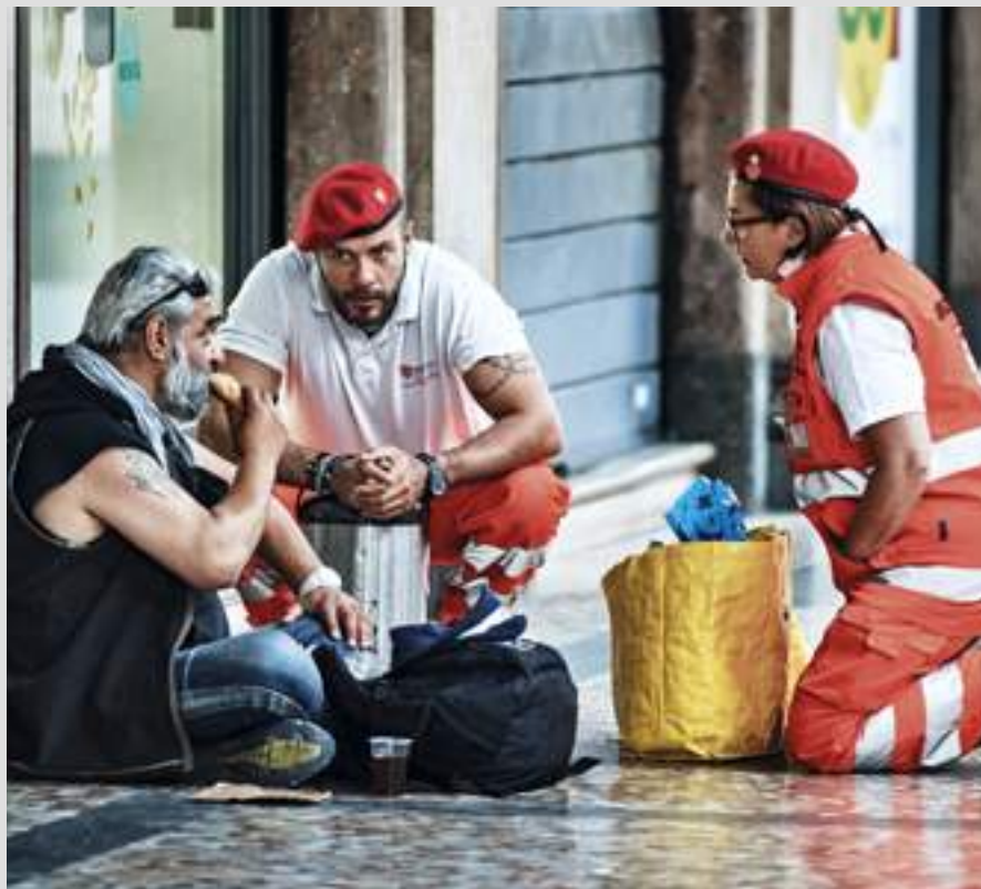
▲ The Italian Relief Corps runs many activities, including distribution of food for the destitute

New activities: a refreshments trolley service for patients at the Sir Anthony Mamo Oncology Centre, launched in 2016; a prison ministry project for young foreign inmates at the Corradino Correctional Facility, with regular visits, and psychological support as they enter rehabilitation programmes. The Order organises an annual Thanksgiving Supper and a summer barbeque for all inmates at the Young Persons Offenders Unit in Mtaħleb; and a forthcoming project to provide shelter and