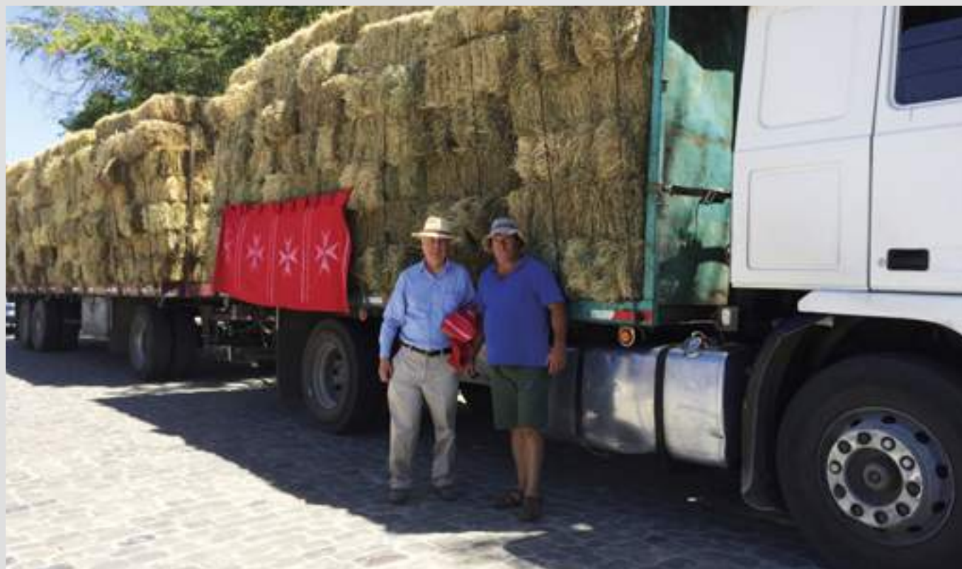
▲ After recent bushfires in Chile, the Order provided essential animal feed

In Loncoche the Shelter Home 'Blessed Karl of Austria' hosts 30 elderly people and provides them with four meals a day. The 'Training Institute Auxilio Maltés', established in