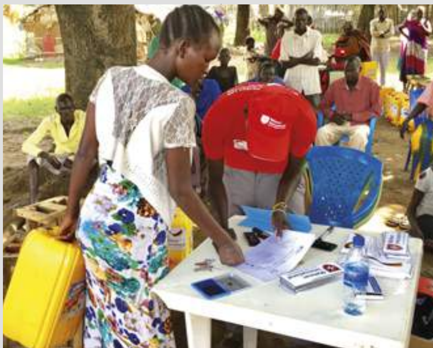
▲ Work continues in Africa to train local farmers in agricultural nutrition and seed cultivation

In a sustainable agriculture project established in 2015, the organisation is working with its local partner to improve nutritional agriculture in Maridi, Mambe and Ngamunde. Tools, plants and seeds plus cultivation instructions are distributed to 1,000 households where husbands died in the civil war.