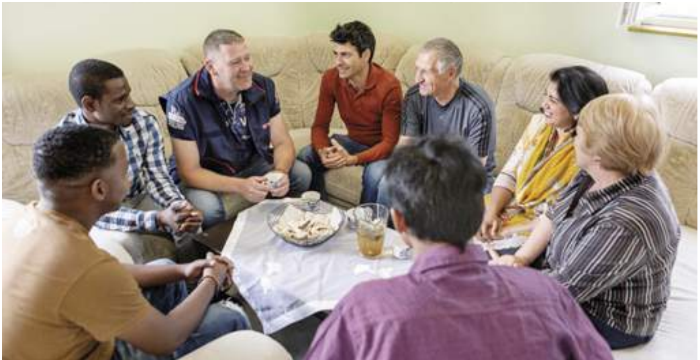
Malteser Germany runs integration programmes in a range of facilities

The consideration of "migration" as a problem can be from three points of view: First point of view is that of the people who make an experience of life-threatening situations, before which there is no choice, but to flee: to move away, to migrate from life-threatening to peaceful or life-assuring situations of places. In this case, the reaction of the communities of the world is to help remove the source of the life-threatening danger, whatever it may be. If it is war, as in the case of the present migration, then the reaction of the world is to quench the fires of war. A cessation of hostilities