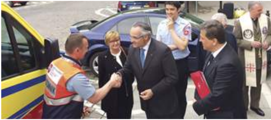
Grand Hospitaller congratulates volunteer teams from the Order's Polish Relief Organisation who work in medical and social assistance projects around the country

Hospitaller says that right now, that response is particularly focussed on migrants and refugees. He notes that in Germany the Order has extensive experience of caring for these groups, since the events of 1989 – and this brings the know-how which promotes the sharing of advice and experience. And he observes that the needs of these groups are the same needs – the people come from different countries, but their needs are the same: for clean water, sanitation, hygiene, food, activities.