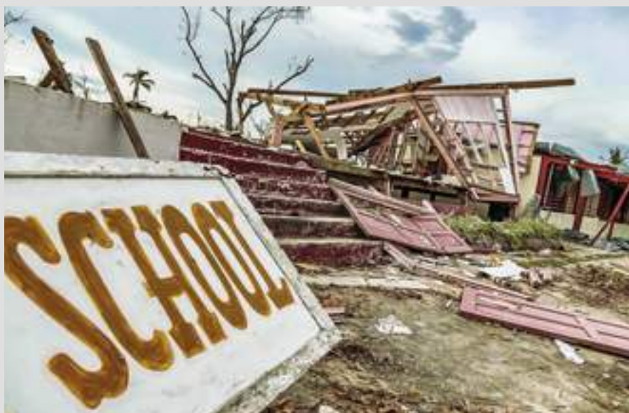
▲ The Order runs disaster risk reduction programmes in southern Asia, where hurricanes are a regular phenomenon

In 2016 the Embassy cared for 60 sick people, some of them terminal patients, providing medicines and food through the 'Healthcare Tbilisi' project. From 2017, among the Embassy's proj-