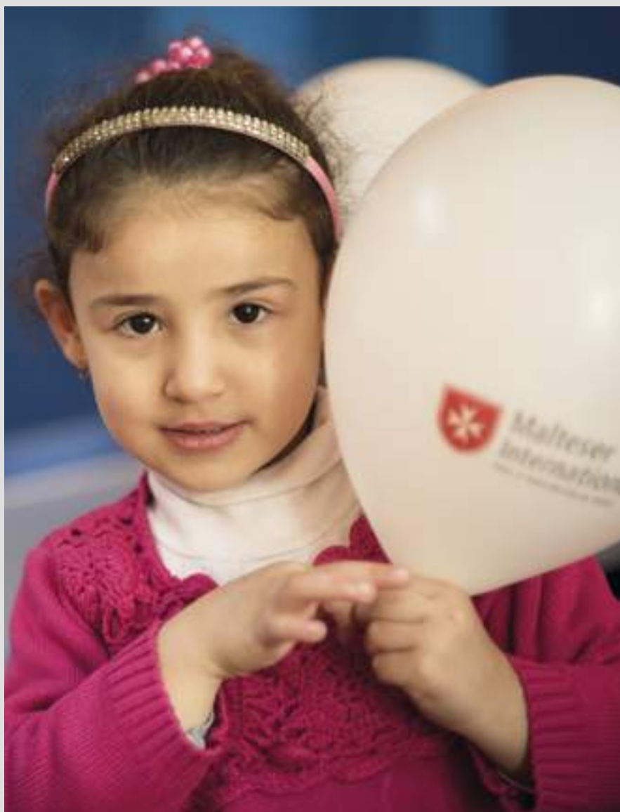
▲ Medical care and schooling for Syrian refugee children in Kilis promises a better future

In Kilis, Turkey, together with a local partner organisation, Malteser International is concentrating on the med-