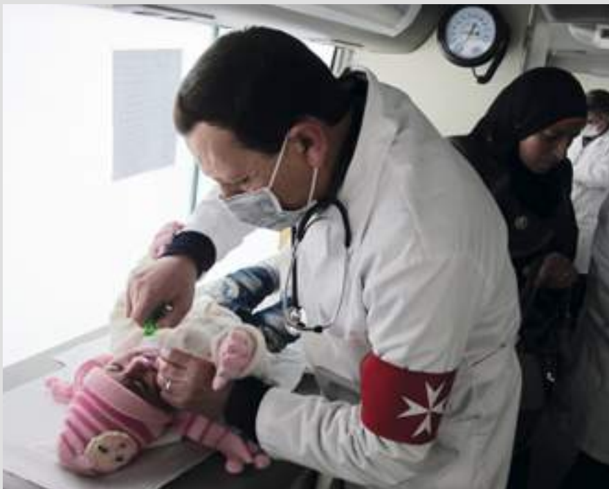
▲ A small Syrian refugee is attended to in the Order's mobile medical clinic in north Lebanon

With the liberation of Mosul in 2017, its citizens began to return gradually, but the situation is precarious, both medically and socially. Malteser International has distributed relief goods and is gradually rebuilding healthcare capacities and offering psychosocial support to the traumatised. They will intensify their work in training and income generation and have launched 'Cash for Work' programmes, with many women participating in courses promoting good hygiene, becoming teachers and helping their communities to respect practices that can prevent epidemics.