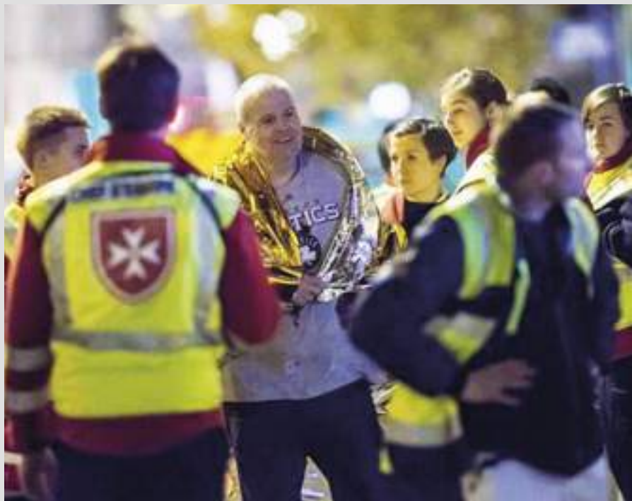
▲ Ordre de Malte France intervenes during the Bataclan attack

The Order of Malta in Germany operates an extensive range of care programmes across the country through its relief corps, Malteser Hilfsdienst (MHD). Founded in 1953, the relief service is now one of the largest charitable service providers in Germany. A