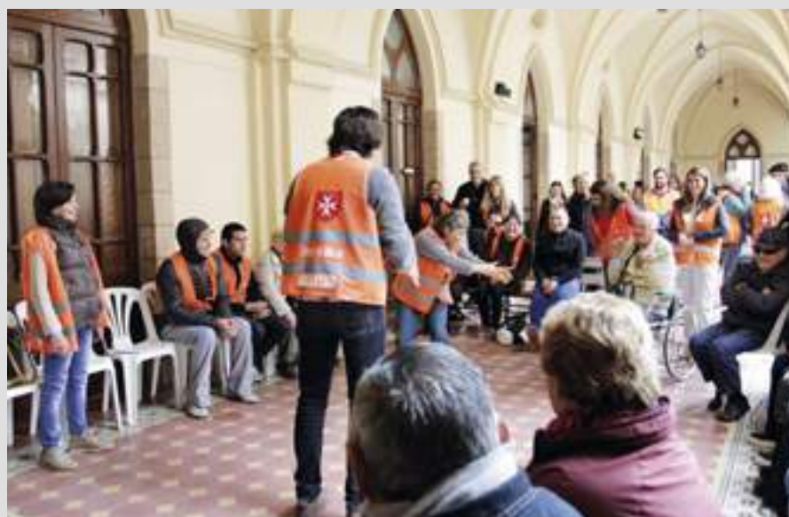
▲ Argentina - Activities and games participation help cheer disabled guests