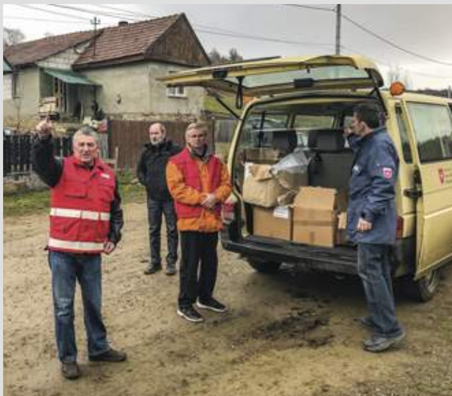
▲ In Eastern Europe, regular deliveries of supplies to impoverished local villages are a lifeline