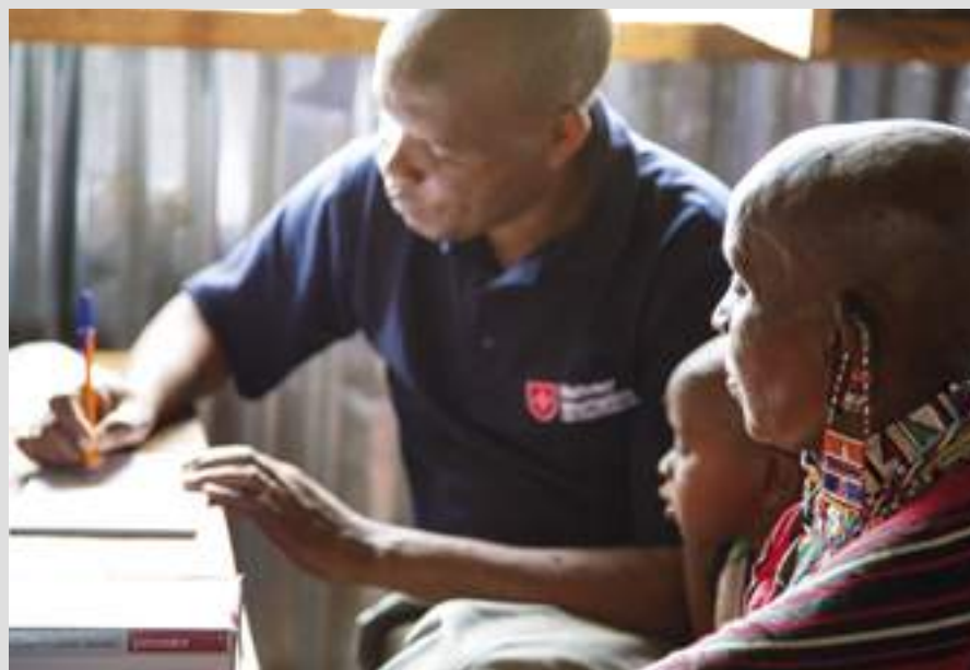
▲ A home visit to a patient suffering from tuberculosis, Oloitokitok, Kenya

The Order supports 12 clinics around the country – at Kayes, Koulikoro,