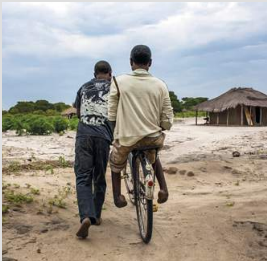
▲ In Mozambique, the Order works with leprosy victims, providing specialist care and training

Segou, Sikasso and Mopti and Bamako district, as well as a specialised centre for children with mental disabilities.