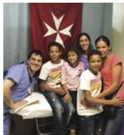
Volunteer medical missions in the Dominican Republic treat locals free of charge, attending to thousands of patients each year

In 2017 the San Juan Bosco Clinic celebrated 25 years of service to the community of documented and non-documented poor in Miami. Members of the Cuban Association continue to volunteer their time and over 800 patients are seen every year and, where necessary, are referred to specialists who provide over 2,800 annual visits free of charge.