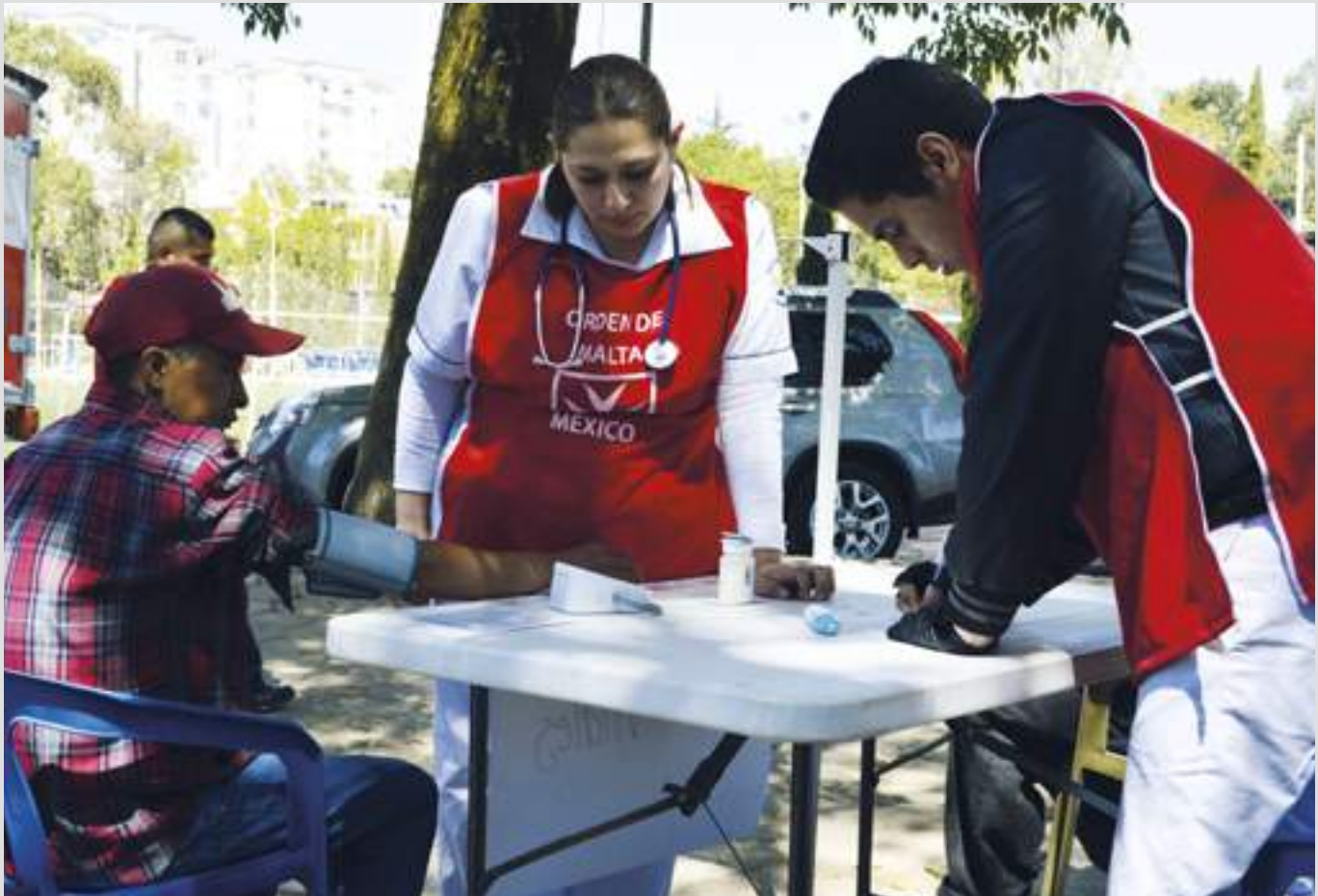
▲ One of the Order's many support activities, from food parcels to medicines, to the disadvantaged

the parishes of San José Obrero and Don Bosco in Tegucigalpa which help poor families with goods imported through the Embassy; and to 'Sor María Rosa' which has established several orphanages throughout the country, most with a medical clinic. In 2017, this assistance amounted to 2,030 tons of medicaments with a value of US$ 13.7 million.