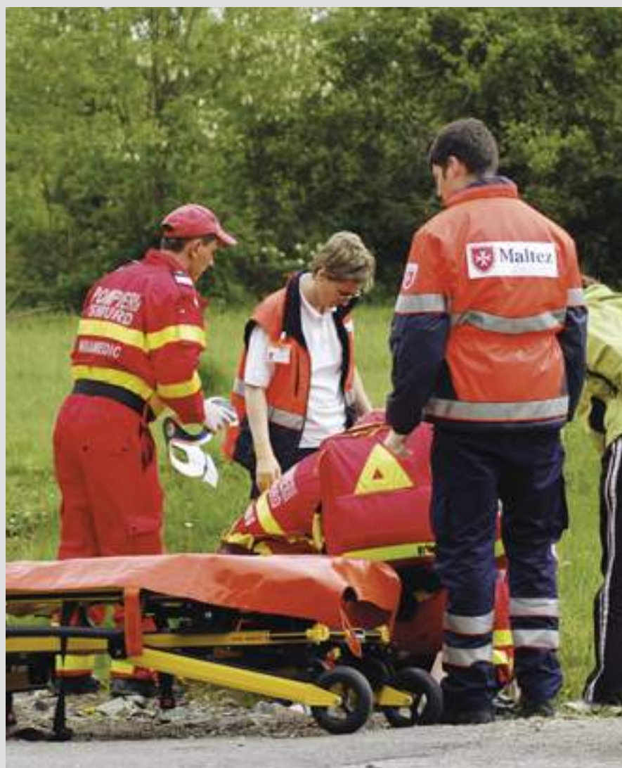
▲ Regular first-aid courses for volunteers in the Serviciul de Ajutor Maltez, Romania: 1,000 work in 100 projects in 26 locations

An important initiative started in 2016 is the development of programmes for