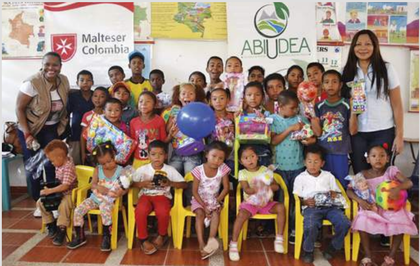
▲ Wide ranging projects in Colombia to aid refugee and indigenous groups in disadvantaged regions include educational activities for youngsters

ern Brazil: carries out activities in São Paulo through the Centro Asistencial Cruz de Malta, with members and 200 regular plus 200 occasional volunteers. Their health care projects aid nearly 60,000 people a year with medical care.