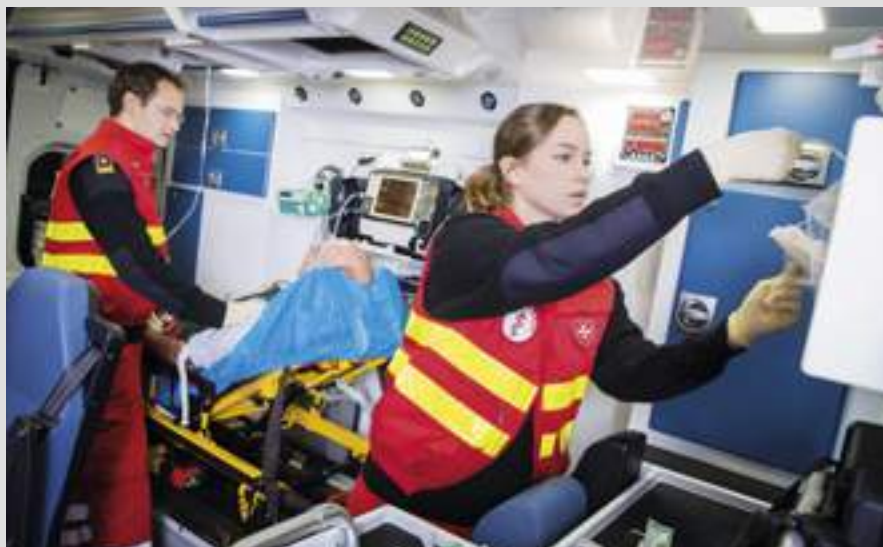
▲ Malteser Hospitaldienst Austria is a significant volunteer emergency service in the country

Malteser Hospitaldienst Austria (which has now unified all its voluntary units) offers a wide range of social activities and programmes, including participation in the Order's International Summer Camp, canoeing in Styria with the handicapped, home and hospital visits, weekly soup kitchen, meals on wheels and leisure activities for the disadvantaged and the elderly. The Malteser Alten- und Krankendienst (MAKD) project: 28 volunteers regularly visit the disabled, the sick, and the homeless in hospitals or hospices, and arrange outings; from Malteser Betreuungsdienst (MBD), 42 volunteers regularly visit 33 disabled at home or in institutions; AIDS Dienst Malteser (ADM) - 13 volunteers make home and hospital visits, run monthly coffee and cake meetings in a general hospital ward, organise leisure activities and outings, and canoeing camps; with Malteser Palliative Dienst (MPD), 16 volunteers come to terminally ill patients at home or in hospital; since 2009 Malteser Medikamentenhilfe (MMH) has been collecting medicines from producers, wholesale traders, and pharmacies and sending them to Afghanistan, Bosnia, Greece, Romania