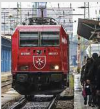
▲ The Hungarian Charity Service works in 350 locations around the country, benefiting 240,000 annually

A founder member of the Charity Service, Fr. Imre Kozma organised assistance for 48,600 East German refugees in 1989 after the fall of the Berlin Wall. Today it has 5,000 regular and 15,000 ad hoc volunteers and is one of Hungary's largest providers of social care. It has 350 locations with 142 local groups, 210 institutions and 840 employees, caring for the elderly, the homeless, the disabled, disadvantaged families and children, and drug addicts. It also operates an emergency service in times of natural disasters. Health care activities cover a hospital, nursing homes, consulting rooms, a mobile pulmonary screening station, a medical device rental service and a vo-