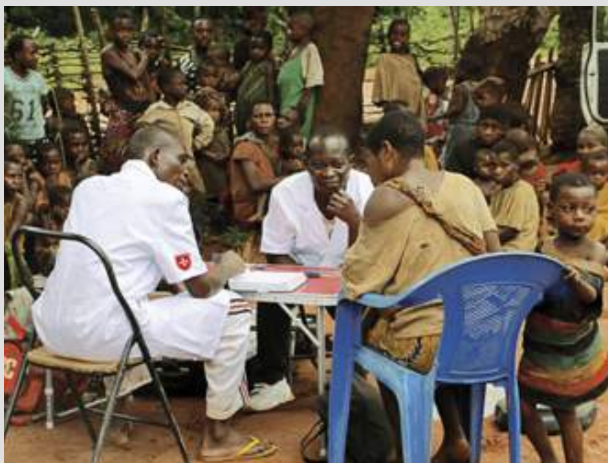
▲ A mobile clinic in northern Congo brings care to local communities and indigenous peoples

haviour. In two homes of the Fondation Stamm, in Bujumbura and Ngozi, funded by Malteser International, the children receive both protection and comprehensive support and care.