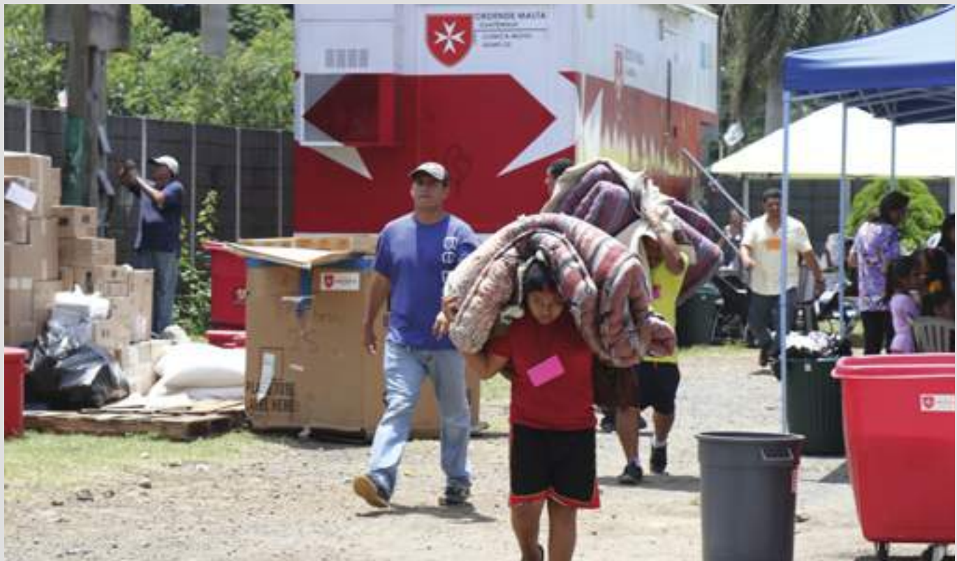
▲ Mobile clinic, Guatemala, delivers basic goods to outlying villages following the volcano eruption

The Order's Embassy has provided direct assistance to local beneficiaries by channelling all donations and dealing with administrative issues. Beneficiaries were the 'Bless the Children' Foundation in the Progreso region, to support children with drug addiction; to 'Our Sisters of Notre Dame' who have set up homes for children and older people in the Progreso region; to