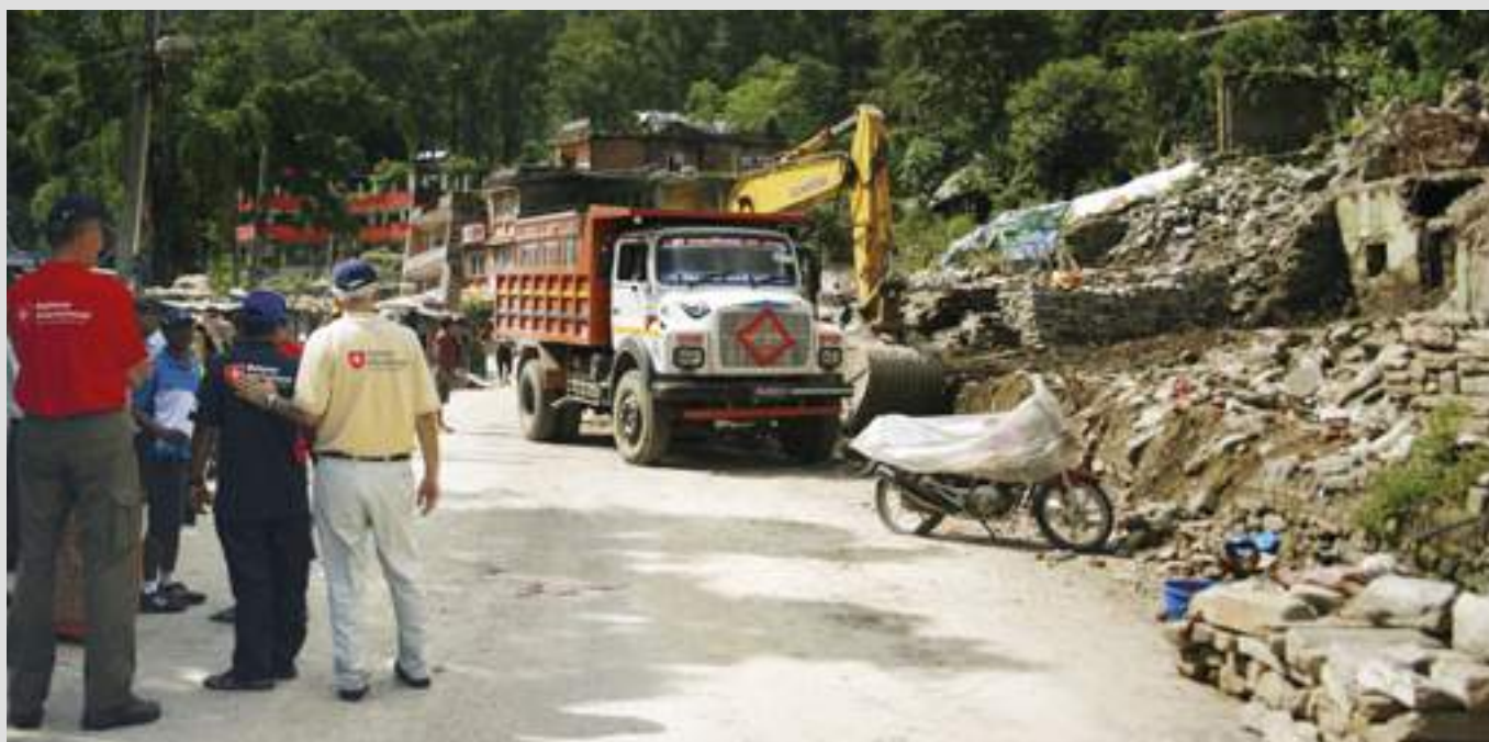
▲ The Order's international relief agency, immediately on site after the Nepal earthquake with emergency aid, is now rebuilding homes and livelihoods

mary health care, WASH, Disaster Risk Reduction programmes, climate change adaptation and post disaster relief. Another focus is health care for displaced people (the Rohingya) who have fled from Myanmar to Thailand and Bangladesh, where they do not have refugee status and are therefore not eligible for medical care.