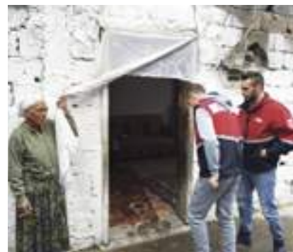
Conditions for many in Albania are very precarious. The Order is providing support to the most needy in the north of the country

We believe that being near our returnees at a time when they feel they are foreigners in their own country, with our staff and volunteers caring for them professionally, is fuelling our energies in support of their reintegration into Albanian society.