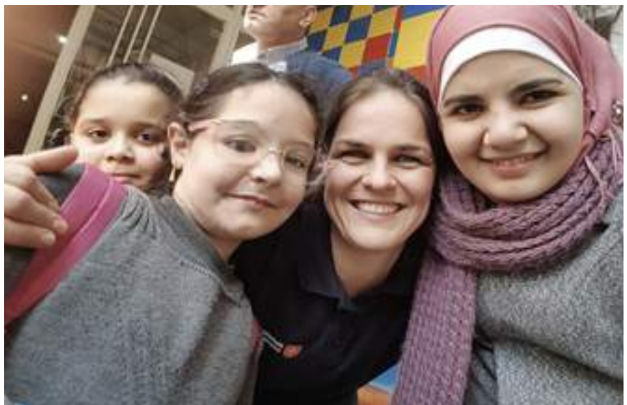
Young refugee students at the Order's school in Kilis, Turkey, integrating into the host country

As well as medical care in the rehabilitation hospital, psychologists and social workers have developed a support programme for patients and their families. Patients come from a cultural background where psychological pathologies are stigmatised, so it is challenging to encourage them to express negative feelings. Making a living in a foreign country while surviving in very crowded housing situations is sometimes more stressful than the experience of violence and harsh conditions during the flight from Syria.