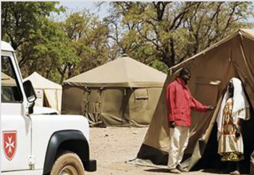
▲ The Order has teams of ambulance drivers and first-aiders in Burkina Faso, serving outlying areas with medical checkups and free medicines

Particular victims of the crisis are the increasing numbers of street children. They have a daily struggle for survival in the big cities and are usually entirely at the mercy of violent and arbitrary be-