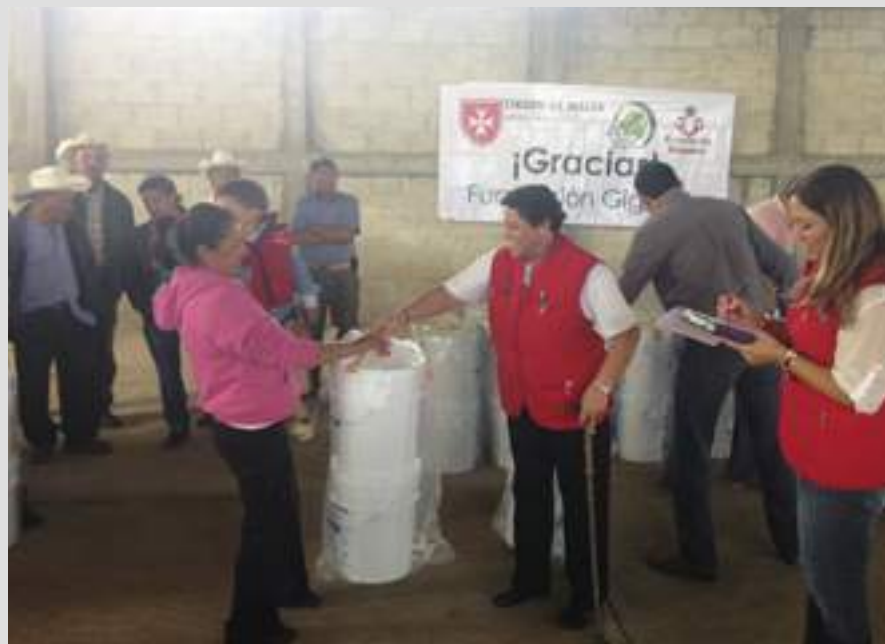
▲ Distributing water filtration equipment after natural disasters

In January 2017, parts of Peru were battered by almost unceasing rains with consequent floods, landslides, loss of life and more than 100,000 people losing their homes. Over half a million were affected by the storms and the resulting damage, over a number of months. In response, staff from Malteser Peru, and Order volunteers, provided food, water, and clothing to victims in Ate in April 2017, and to victims in Piura in May.