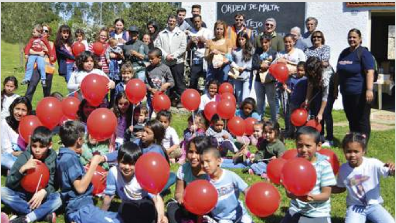
▲ Order volunteers regularly prepare lunches and picnics for poor children in Montevideo, Uruguay

tainer of beds and furniture donated by the Swiss Association); supports the 'Hogar Casita del Señor', a home for elderly, low income women, which was built with a donation from the Association; in Canelones, on the ground floor of the Association's new premises, a residential hospice, 'Hogar Monseñor Jacinto Vera', shelters 35 young mothers and their children; a night and day shelter, 'Hogar La Milagrosa' houses 30 people each night and 30 each day. The Association also provides dental prevention and therapy to a school of 220 pupils, in Junta Local. Education initiatives: courses of catechism and arithmetic for the children living in one of the Montevideo homes; a computer training centre established in the Association's premises in Canelones. The 'Cocina Solidaria 2017' fed 70 poor children in the Fortaleza Barrio, Montevideo, over the cold season, with members and volunteers providing 1,000 lunches and 3,000 'empanadas' (pasties).