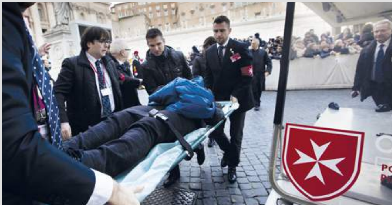
▲ The First Aid Post operates every day on both sides of St Peter's Square

From April 2018 first aid services in San Paolo Fuori le Mura and San Giovanni in Laterano have been added.