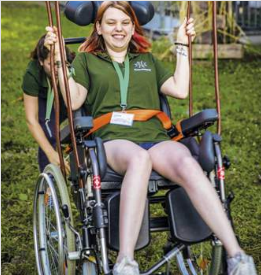
▲ 4,000 volunteers divided into 80 units form the Ambulance Corps in Ireland

conditions offer a relaxing time for all. With 800 participants in 2016 over 12 weekends, the response has far exceeded expected participation in the project. A project to provide food, clothing and support for the homeless in St Stephens Green in Dublin – the ‘Knight Run’ - has been operating since 2014. Guests and carers participated in the Order’s International Summer Camp for Young Disabled in 2016, 2017, 2018.