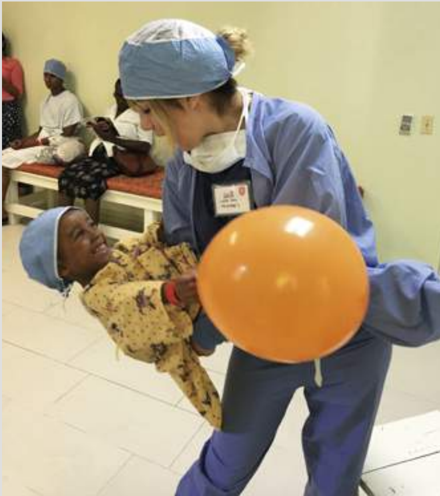
▲ The Dominican Association manages mother and childcare in poor areas of Santo Domingo