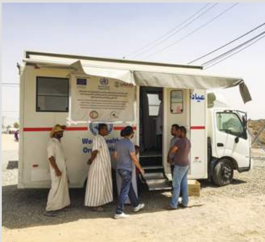
▲ Malteser International mobile medical teams provide medical aid to IDPs in camps around Erbil, Iraq

For the elderly in rural areas, where the exodus of the young for jobs in the cities brings loneliness, there are three day care centres and five 'warm homes', bringing companionship and social activities. They cater for 55 villages with a total of 1,168 elderly, for