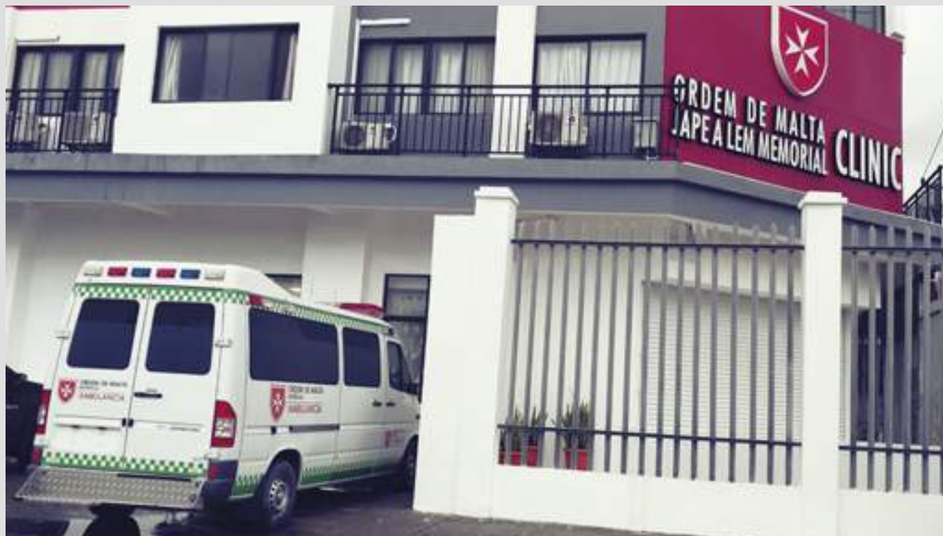
▲ The Order's clinic in Timor-Leste treats 200 patients every day

time called the Malteser Foreign Aid Service. Fifty years on, the organisation now has a special emphasis in the central provinces, among the poorest areas in the country, on disaster risk reduction awareness, in particular for the risks posed to the disabled caught up in these crises. Training workshops for their inclusion in DRR are given at community, district and regional level. In Vietnam 7.8% of people have one or more disabilities. Malteser International also runs a variety of activities: hygiene education in schools, nutrition awareness, forest preservation as well as disaster preparedness in villages. Ordre de Malte France runs six medical centres in the country, with operating theatres specialised in treating leprosy. The centres in Ben San, Cantho, Nha Trang, Quy Hoa and Ho Chi Minh Ville deal with rehabilitation surgery for leprosy patients, in Diling treatment is for diabetic and leprosy ulcers and in Quy Hoa, specialisations are in ophthalmology.