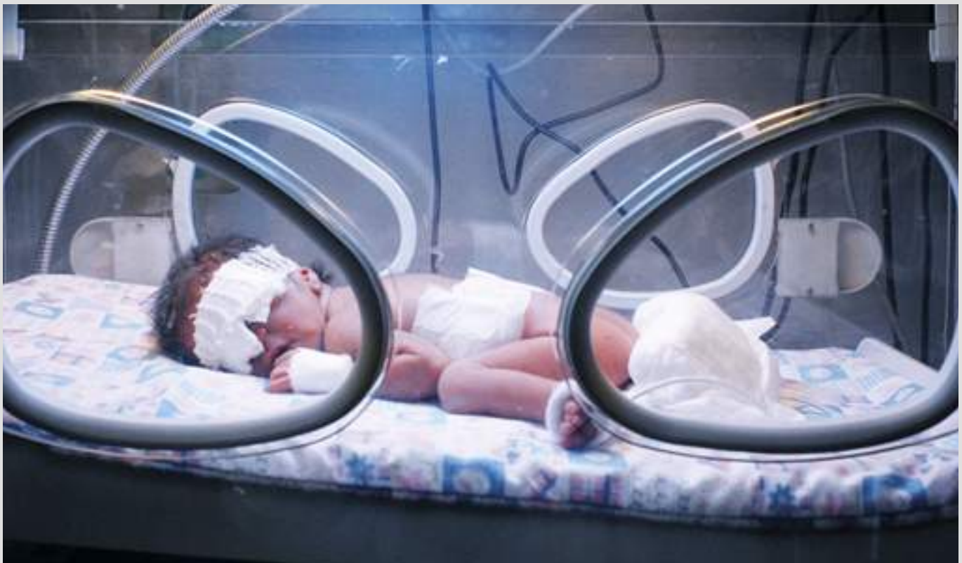
▲ The Order's Holy Family Hospital in Bethlehem offers the only neonatal intensive care unit for newborns in the region

A Dignity Loan programme launched in 2013 in the Salfit region by the Order's Representative Office to Palestine continues to give microeconomic loans to local small businesses, creating jobs and improving economic outcomes. In consultation with local community partners, the interest-free loans typically have a repayment period of 1-3