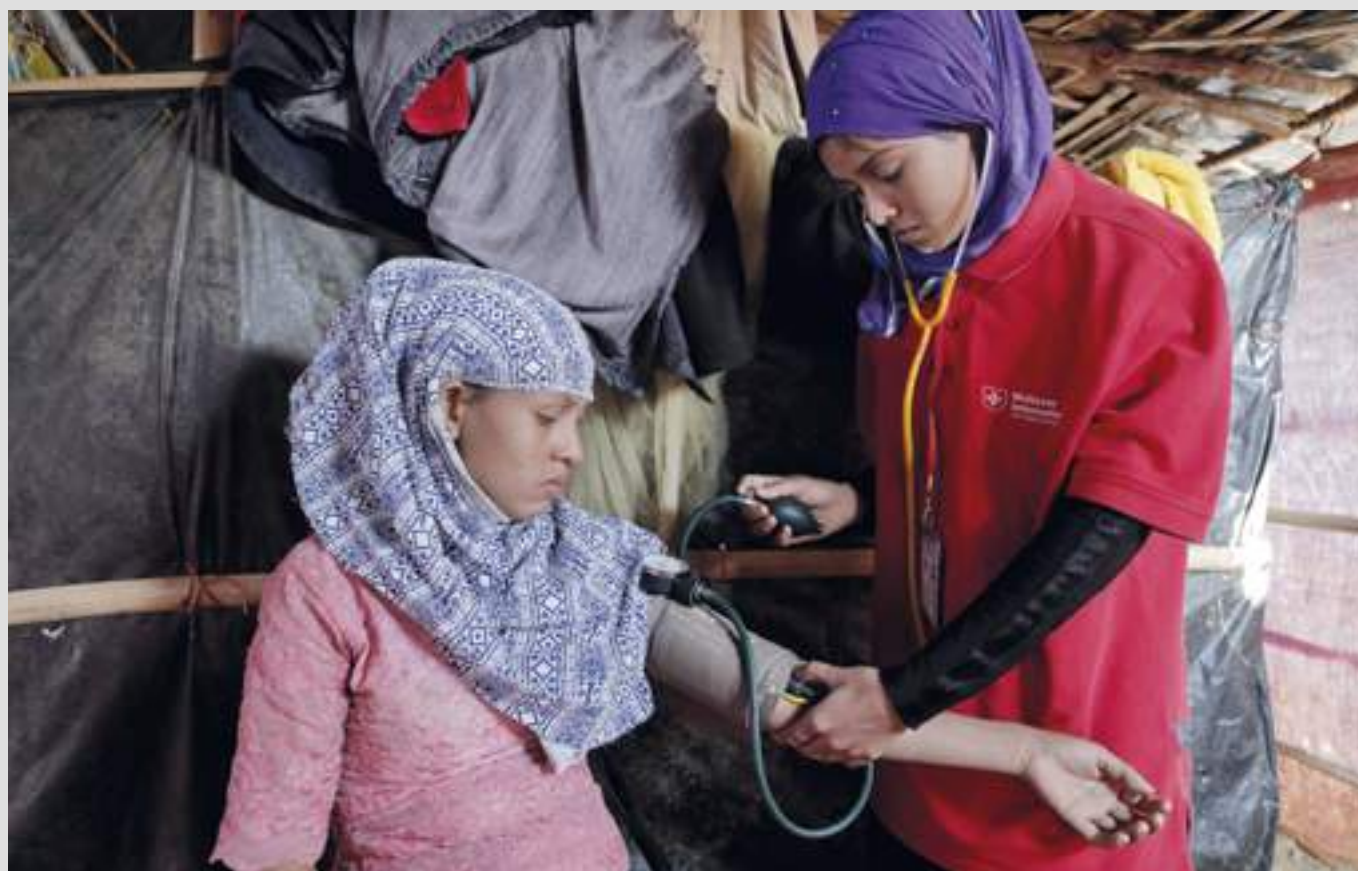
▲ Providing care for displaced Rohingya in refugee camps

Malteser International has been working in Myanmar since 1996, employing its own staff from 2001. It now employs more than 350 local staff in Rakhine, Shan and Kayin states, operating in pri-