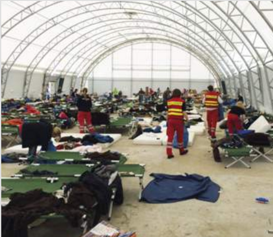
▲ Refugees are cared for on arrival in Austria. Malteser Hospitaldienst Austria has been providing a wide range of care for those in need since 1956