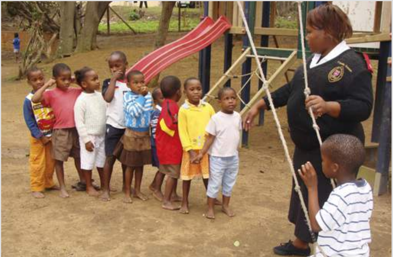
▲ At the Brotherhood of Blessed Gérard, South Africa, teachers work with young orphans

Hospice and palliative care: there is residential palliative care for terminally ill patients in the inpatient unit. It can accommodate up to 40 patients. In