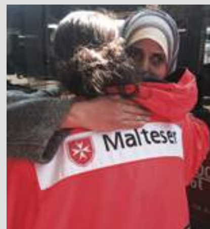
▲ Closeness counts: Malteser Hilfsdienst runs care programmes nationwide

Trained staff also run outpatient care for sufferers in their own homes, and outpatient services also include training for relatives and advice on nursing care and long-term care.