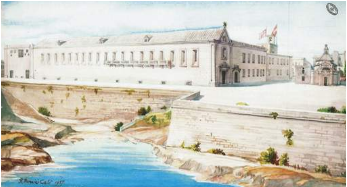
The Sacra Infermeria, Malta

oretical anatomy and surgery was given to the barber-surgeons of the Sacra Infermeria and to all other youths who aspired to join the surgical profession, provided that they could read and write. Other disciplines such as the surgical aspects of physiology, pathology, hygiene and therapeutics were added later to the curriculum and by 1682 the course in surgery lasted ten years. The foundation of the Collegio Medico in 1771 by Grand Master Pinto in his newly established Pubblica Università di Studi Generali further strengthened medical training in Malta. The Maltese Joseph Barth cannot be omitted from the list of illustrious sons of the School of Anatomy and Surgery at the Sacra Infermeria in Valletta. He was to take the Chair of Ophthalmology at the University of Vienna in 1774. The people of Malta have reason to be proud that their university, founded by the knights, is the oldest in the Commonwealth outside the United Kingdom.