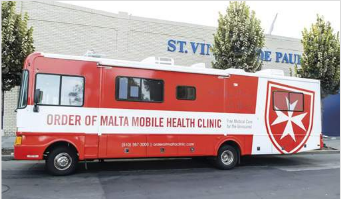
▲ The free mobile clinic operated by the Order's Western Association in Oakland, California, treated over 3000 patients in 2018