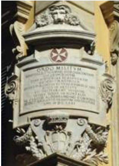
Memorial plaque, Magistral Palace, Rome

tremely serious conflicts in the Middle East, with particular concern expressed for the Syrians and Iraqis.