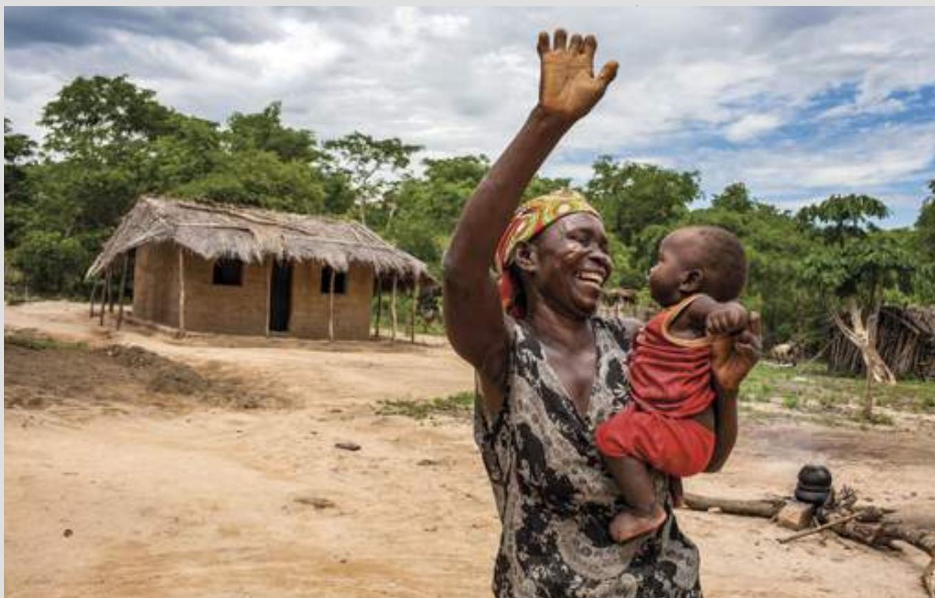
▲ The Order focuses on care for leprosy sufferers, showing them how to look after themselves

itation, health and food security, now adds the largest Ebola programme in Africa.