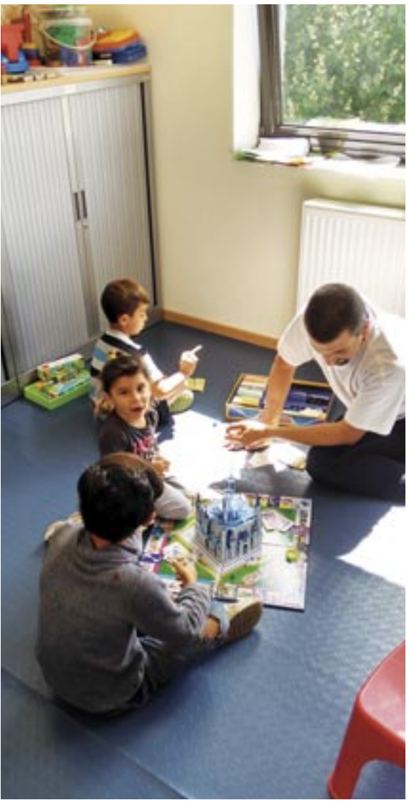
A special project focusses on play to integrate school groups

In response to the growing number of Roma living in the city, the Belgian Association of the Order of Malta has adapted an entire floor of its La Fontaine hospice for the homeless in Ghent to create special support for Roma children. Since early 2016, weekly classes in the Flemish language are being run for the children, as well as social adaptation training: every child who comes has to take a shower, can change and wash their clothes, and receive training in personal hygiene and basic first aid. Educational and computer games are also on offer. The aim is to integrate the children into the local environment, providing education and fun at the same time and, as word gets around, gradually more and more children are taking part. Communication with the children is key and, as with other Order programmes for the Roma, the Association's first call is always to engage the interest of the mothers and to explain that their children's future depends on integration into local society. Funding support is from the Order's Ambassador to the Roma, the Belgian Association, and a cooperative, with discussions for additional support from the city of Ghent.