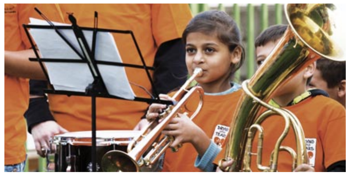
Rehearsing her trumpet solo - the Hungarian Roma Sinfonia players