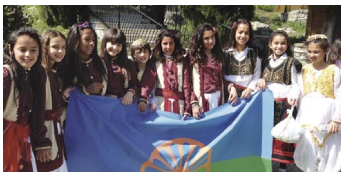
Annual summer camp in Albania for Roma children means fun and community integration