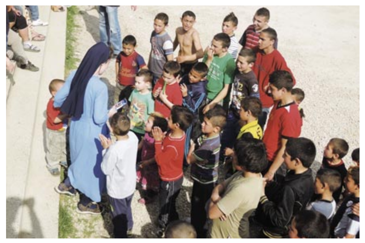
Storytime with young Roma in Slovakia

Roma population in Slovakia: approximately 490,000 (European Commission Factsheet 2014).