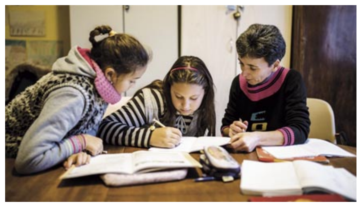
After school work helps young students to improve their academic performance

In this village of 800 people, ninety per cent are Roma and the majority of families have had no experience of work for generations. After finishing school, the children had no way of avoiding unemployment. In cooperation with the local government, the Charity Service started the 'Reception Village Programme'. Homeless families from Budapest were received in empty houses in Tarnabod. The Service purchased a minibus – there is no public transport – so people can go to work in surrounding settlements. The Service also supports family farming. Ten years ago, with government support the Service converted an empty stable into an electronic waste disassembling unit, creating thirty jobs. The plant is now self-supporting.