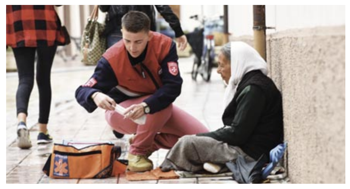
A street help programme assists an elderly Roma in Romania

The key to their future is to teach the children. Coordinating with governments and local authorities, the Order of Malta aims to give them a future in their own country, with successful integration into local communities.