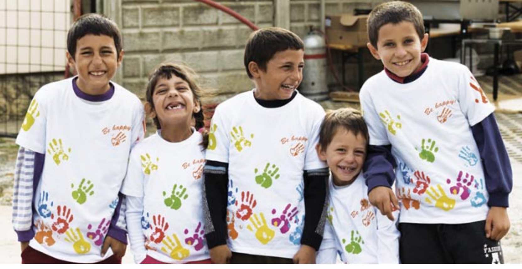
An art group project brings Roma youngsters together