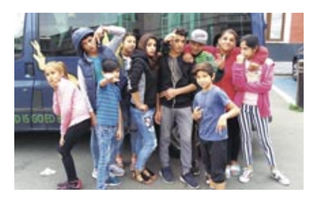
After school activities in Ghent, Belgium, promote enjoyable ways to learn