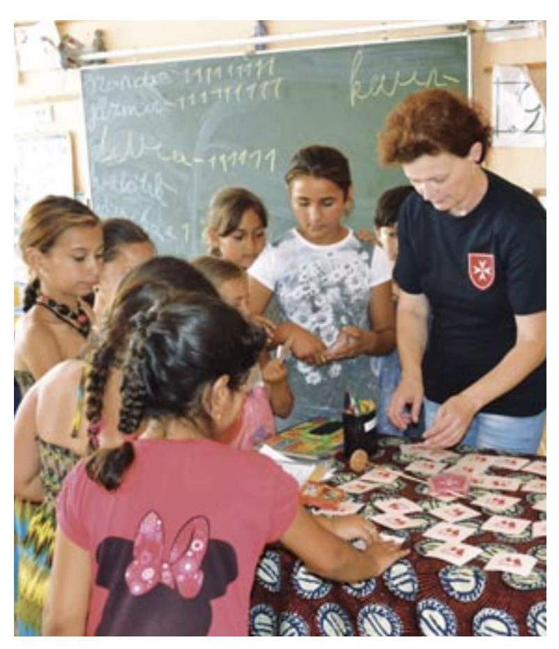
A new after school project in Beregovo: learning games for young Roma

Beregovo has a population of over 7,000 Roma who live on the edges of the society, in extremely poor habitations, with a lack of basic services. The Order of Malta has been engaged in providing a clean water system, including clean drinking water and a wash house for the community, and educating the population in safe hygiene practices. Very successful results of after school tutoring for Roma children impress the school inspectorate. Plans underway in 2018 focus on a mobile dental clinic, to operate in the city.